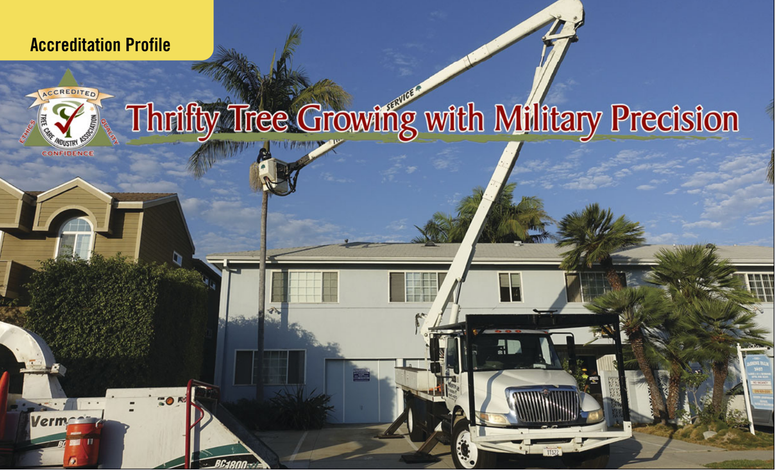
A Thrifty Tree Service crew member makes use of an aerial lift to remove the fruit from a king palm.